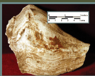
Heavy wear on the end of this whelk indicates that it was used as a gouge or adze.