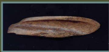
Bone fid. Fids are crafted from large mammal long-bones that have been splintered by cutting or smashing. The resultant pieces are ground to shape and used in net and basket making.