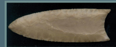
A Clovis point. The ‘flute’ or channel up the middle of the point was for hafting onto a spear; deep flutes occur only on Paleolithic points.