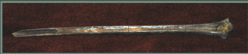
Turkey metatarsal (leg) awl. Awls were used for punching holes in skins or leather, and for sewing garments or other articles of clothing.